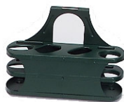
BK1220 Metal Tool Carrier (Blue) BK1215 Metal Tool Carrier (Green)

The metal tool carrier is designed to add convenience to your life.