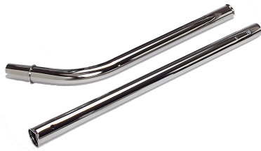
AT1101 AirTec Lower Wand AT1102 AirTec Upper Wand

For durability. For outstanding design. For added convenience.